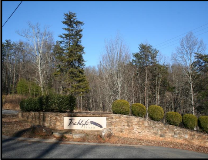
0 Ranch Mountain Court, Dahlonega, GA 30533