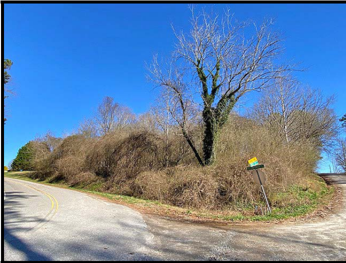
6906 Yellow Creek Road Murrayville, GA 30564