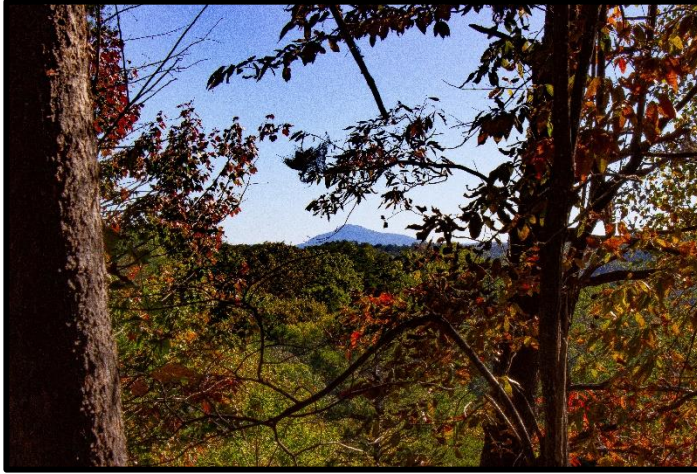
0 Calhoun Road Dahlonega, GA 30533