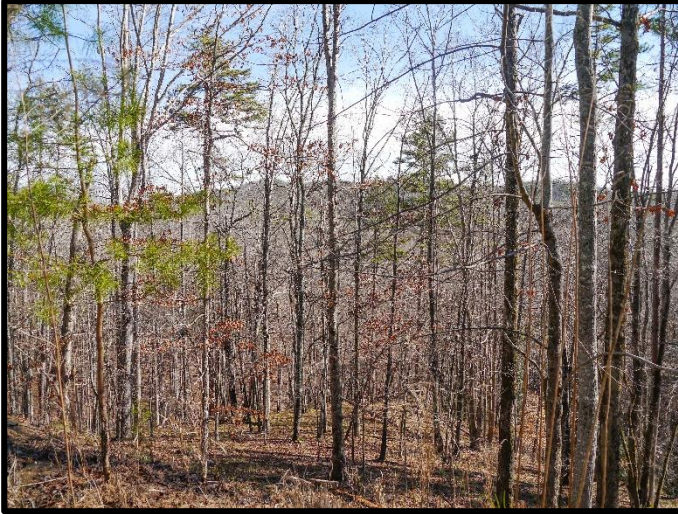
0 Golden Avenue, Dahlonega, GA